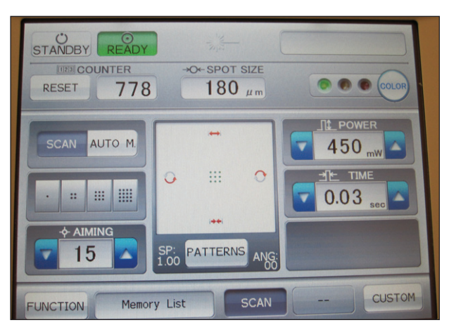
Figure 3. All laser parameters can be rapidly adjusted from the touch screen console.

In our experience, this laser saves time by requiring fewer sessions, consumes less energy, and provides more versatility than conventional models. It allows us to employ rapid and optimally powered laser emission for laser photoco-